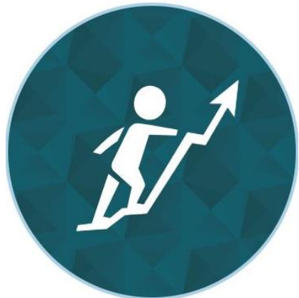
ECONOMIC PRODUCTIVITY & HOUSING