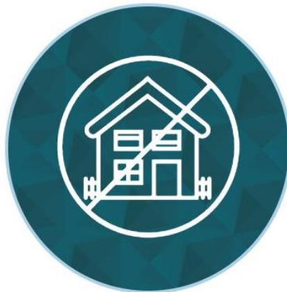
HOMELESSNESS & HOUSING