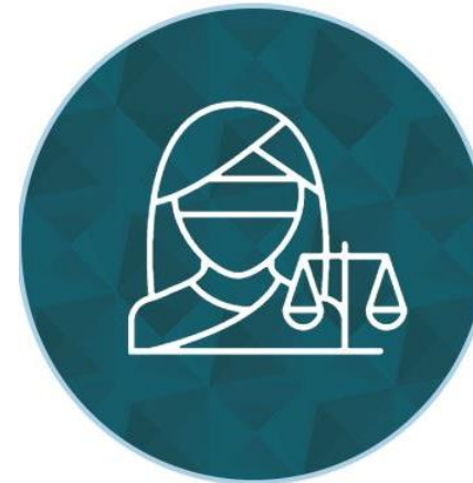
CIVIL RIGHTS & HOUSING