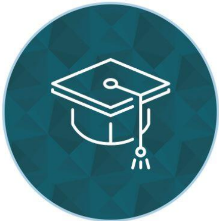
EDUCATION & HOUSING

@OppStartsatHome #OpportunityStartsatHome