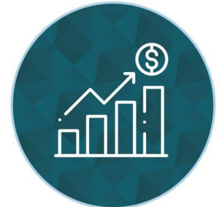
ECONOMIC MOBILITY & HOUSING