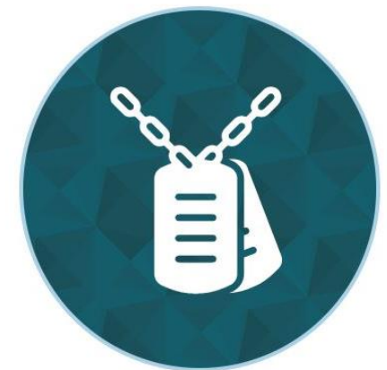
VETERANS & HOUSING