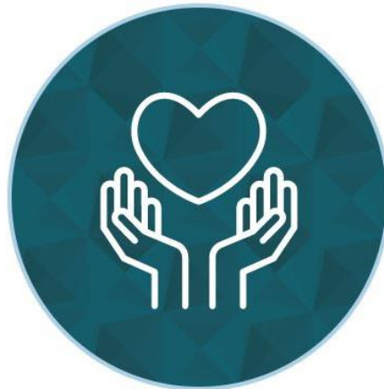
HEALTH & HOUSING