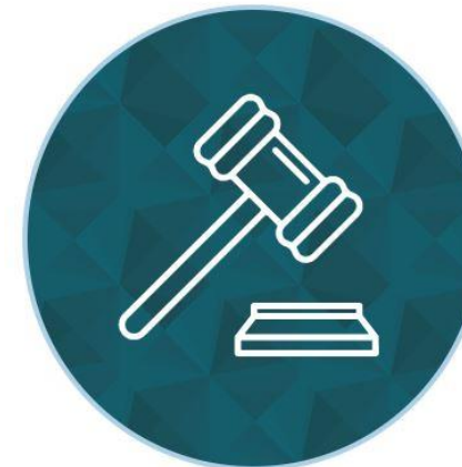
CRIMINAL JUSTICE & HOUSING