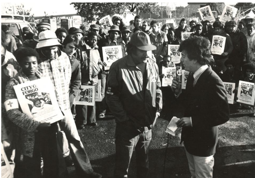
Ensuring our voices were heard