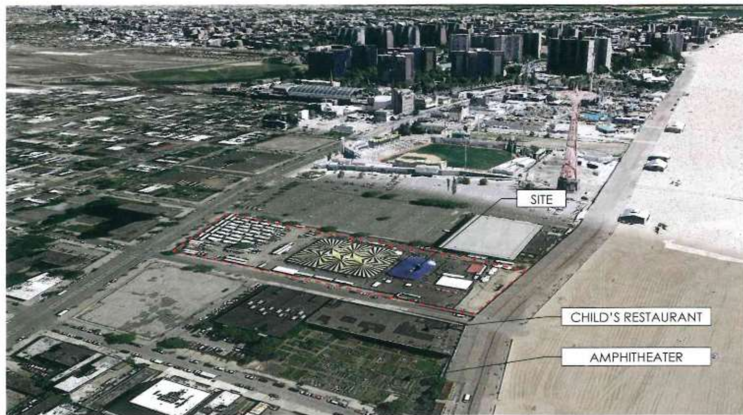
VIEW FROM SOUTHWEST