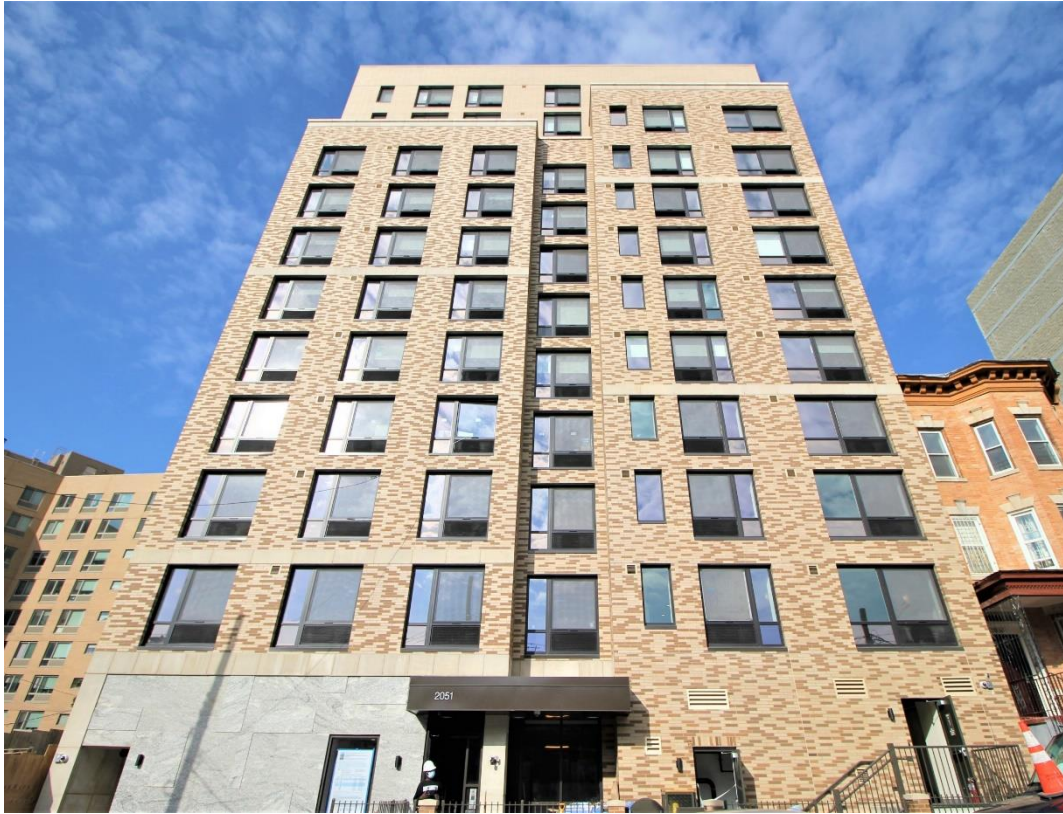
2051 Ryer Avenue, Bronx