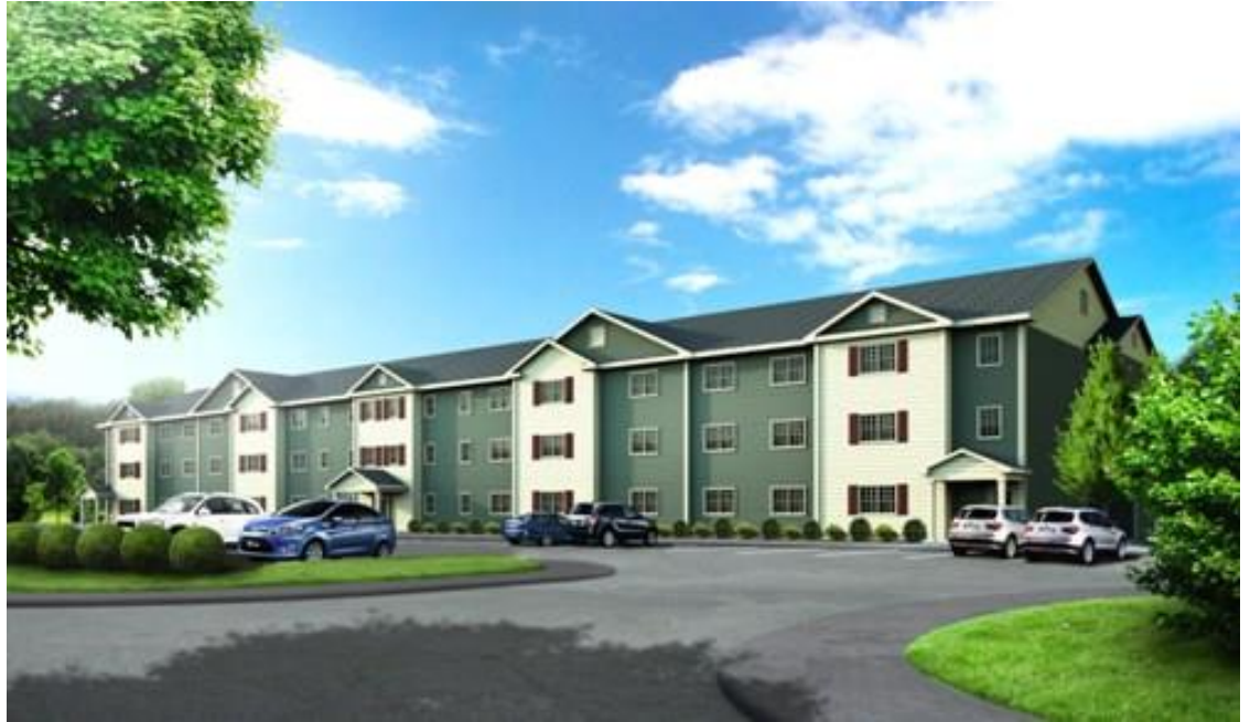
Edward Diana Way, Middletown