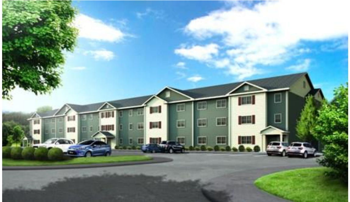
Isabella Way, Monticello