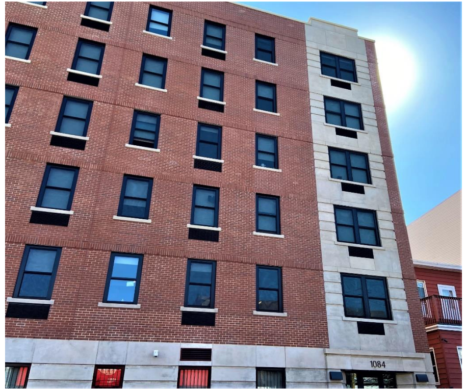
1084 Ogden Avenue, Bronx