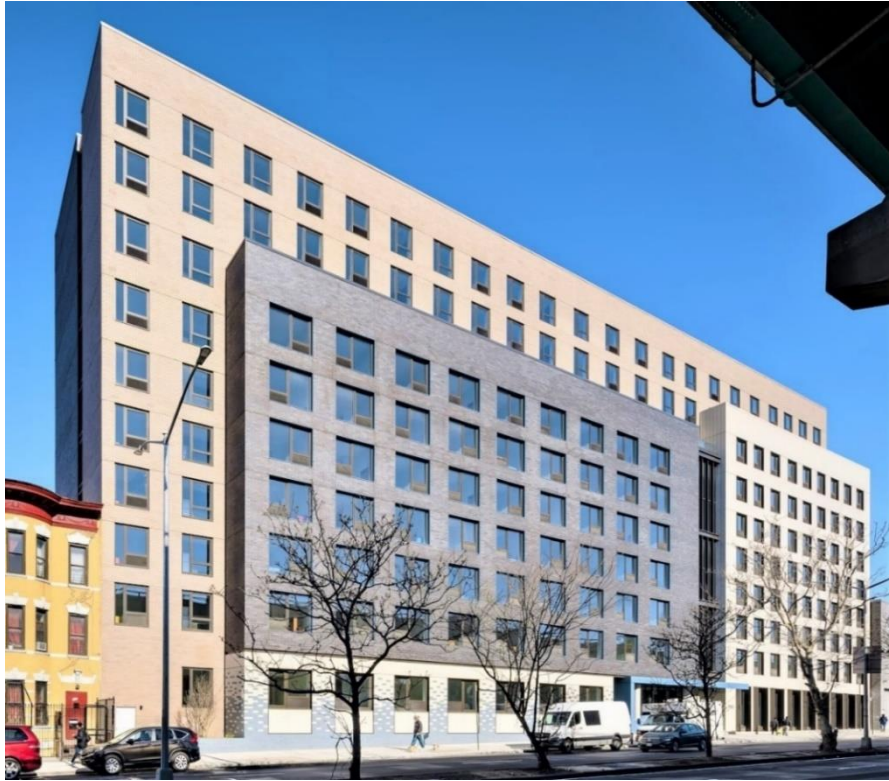
985 Bruckner Boulevard, Bronx