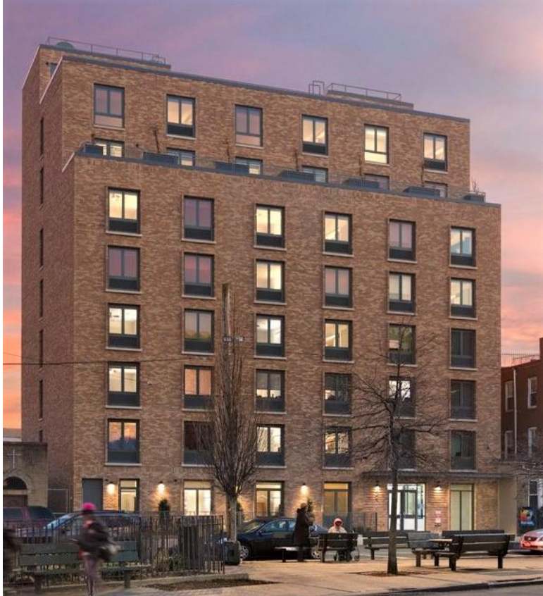
212 Hegeman Avenue, Brooklyn