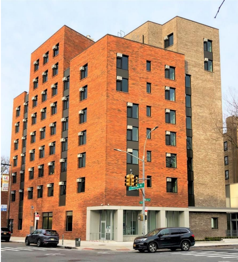
1921 Cortelyou Road, Brooklyn