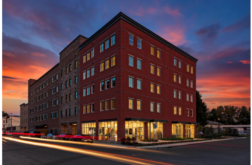
20 Cedar Street, Kingston