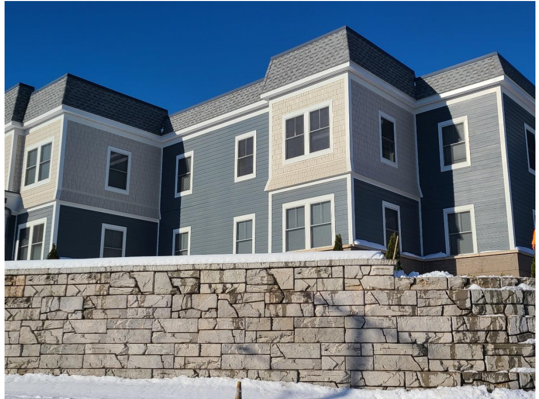
Butternut Avenue, Syracuse