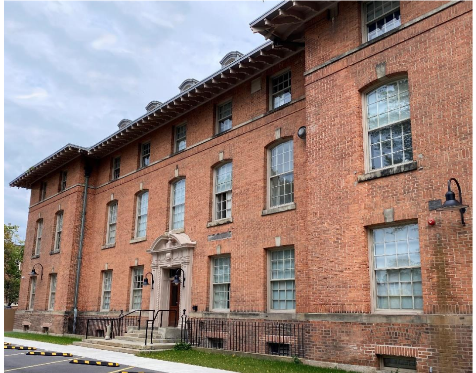
2495 Main Street, Buffalo