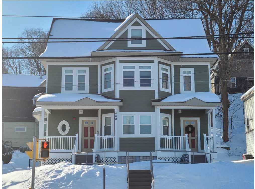
Genesee Street, Syracuse