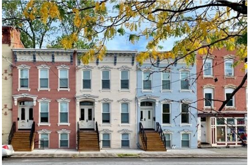
Clinton Avenue, Albany