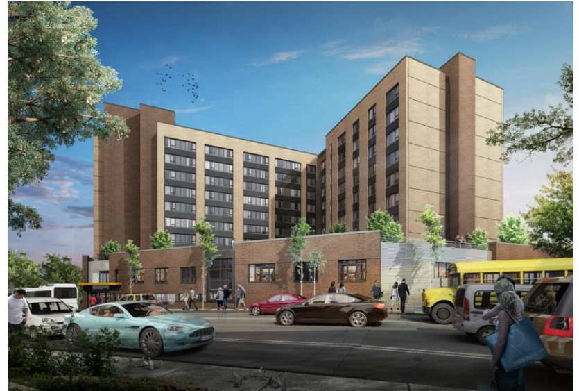
1880 Boston Road, Bronx Photo credit: SLCE Architects