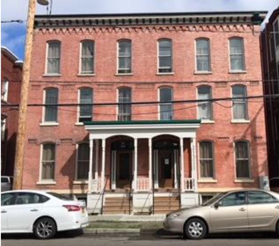
Carroll Street, Binghamton