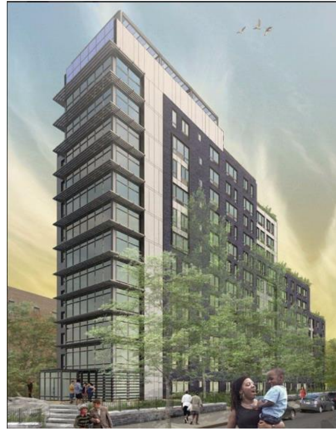
1180 Fulton Avenue, Bronx