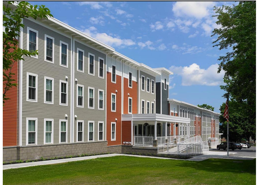
West Street, Utica