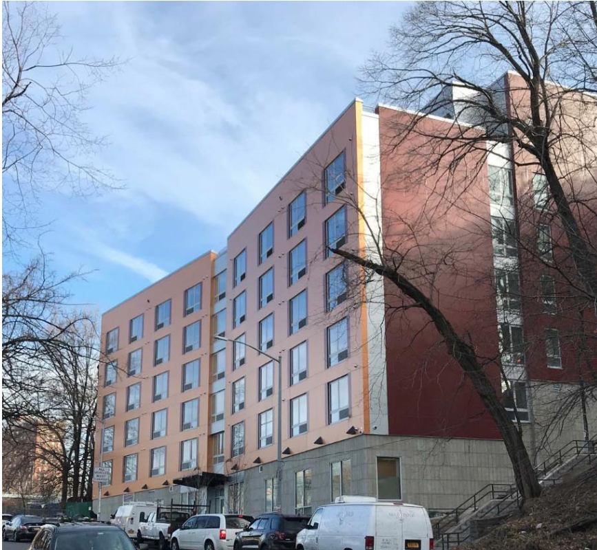
1434 Undercliff Avenue, Bronx