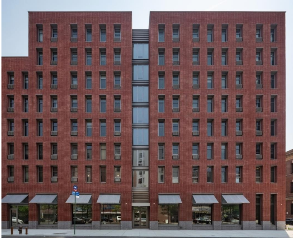
411 East 178th Street, Bronx