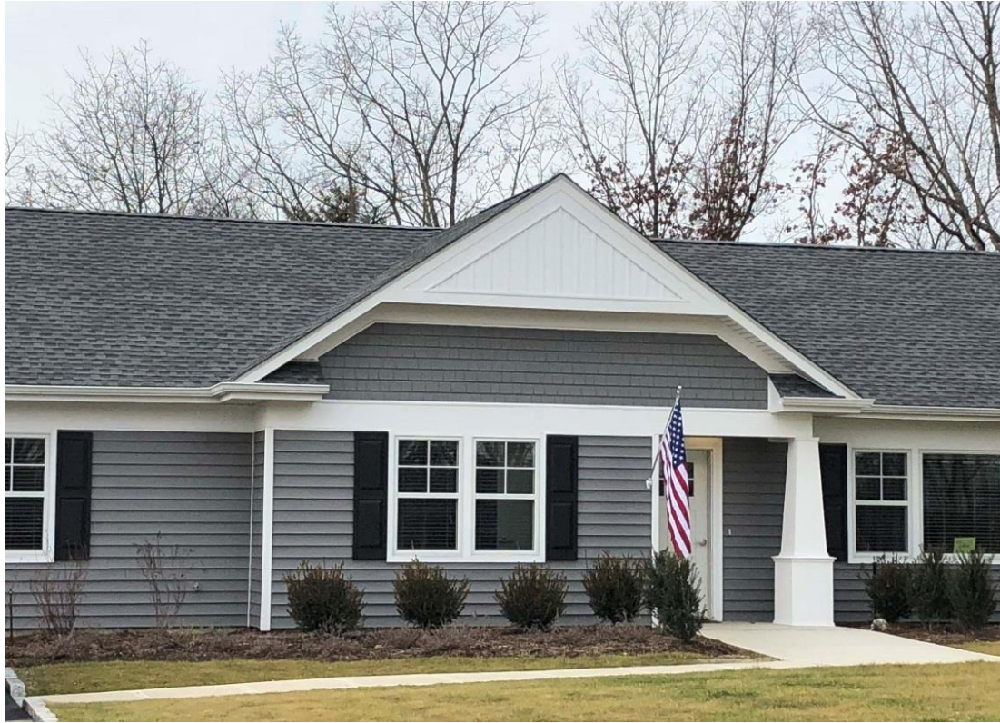
Sycamore Ave, Central Islip