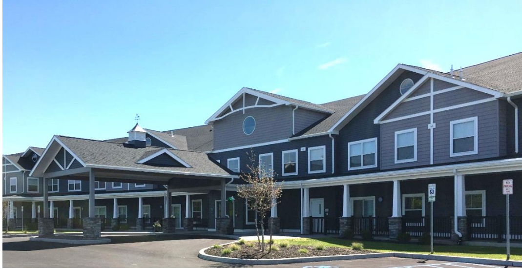
Union Street, Hudson