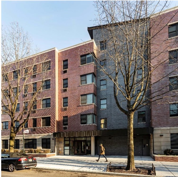
500 Gates Avenue, Brooklyn