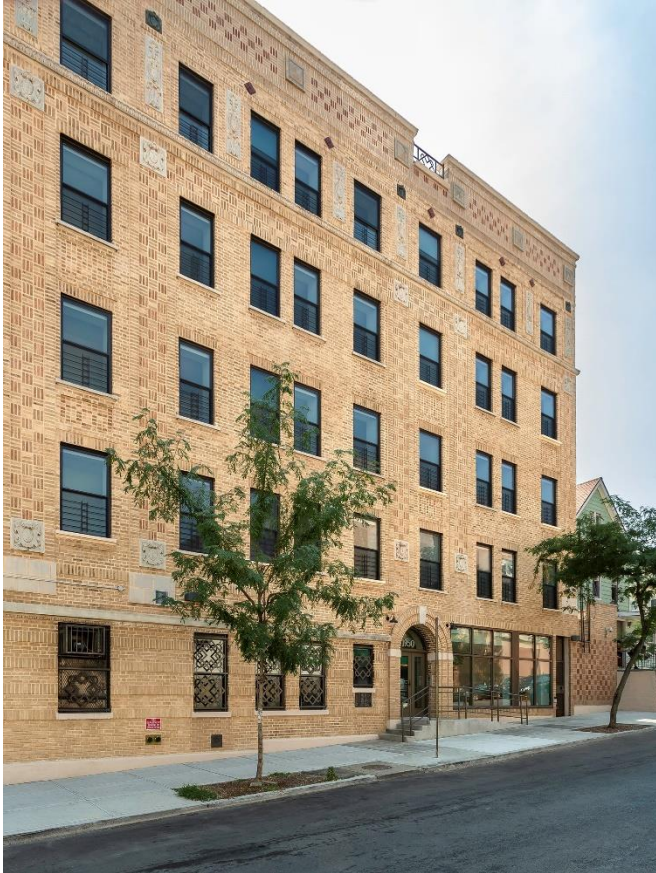
1950 Prospect Avenue, Bronx