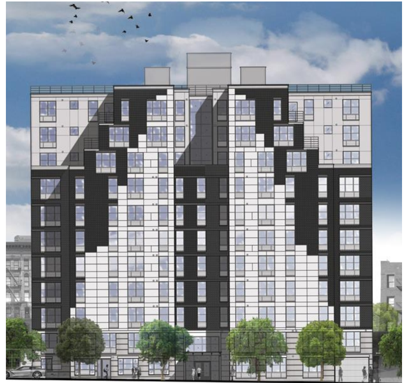
2264 Morris Avenue, Bronx