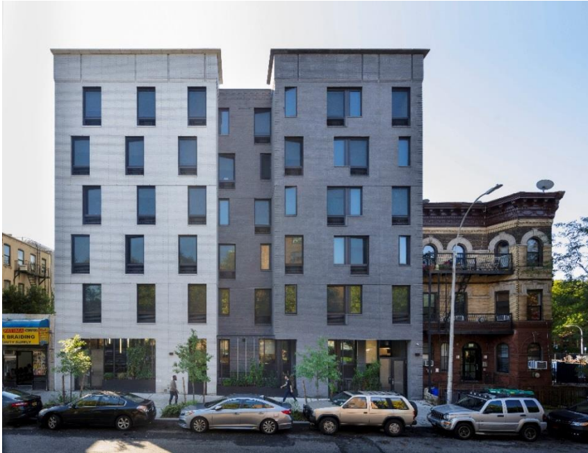
1066 Myrtle Avenue, Bronx