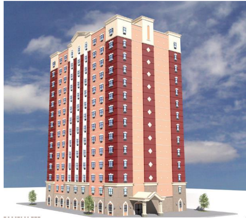
126-30 Locust Manor Lane, Queens