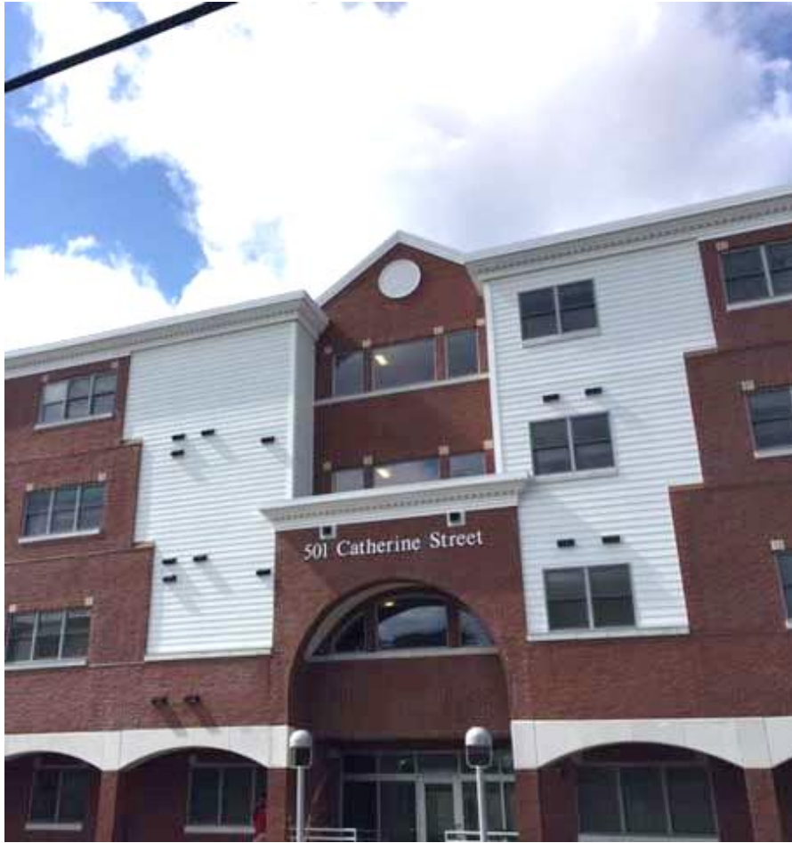
Catherine Street, Syracuse