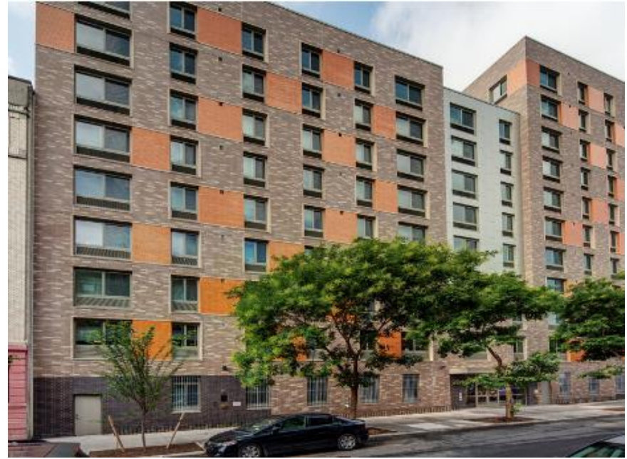
294 East 162nd Street, Bronx