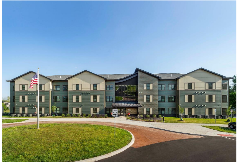
Elmwood Avenue, Lockport