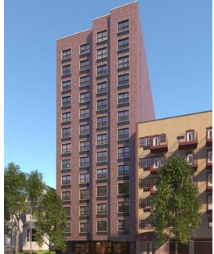
333 Lenox Road, Brooklyn