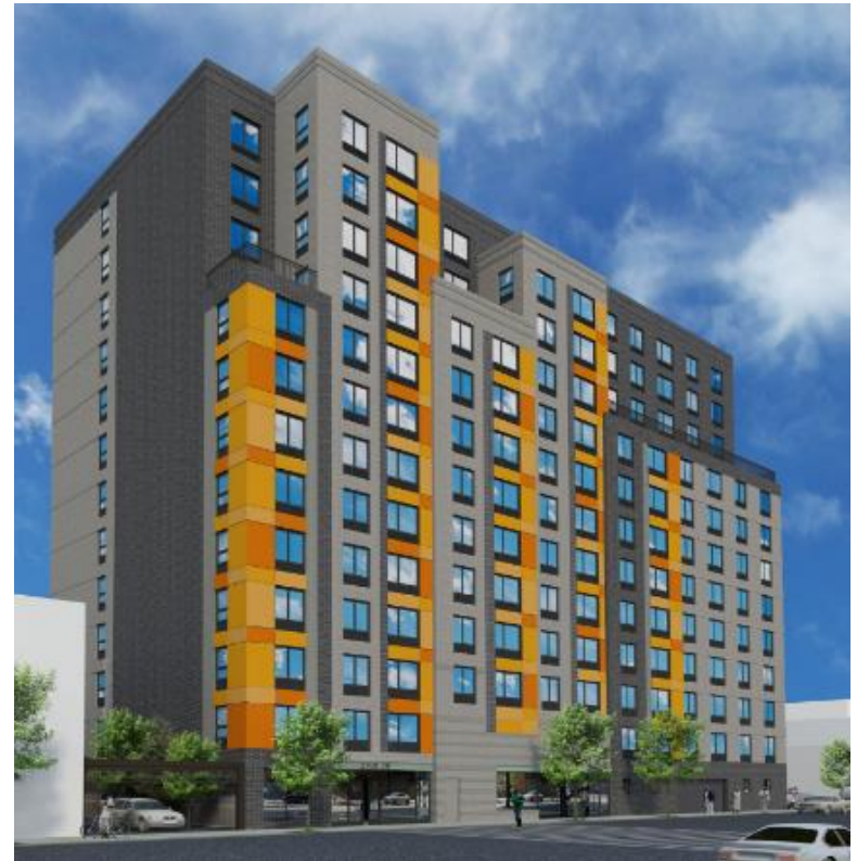
722 East 212 Street, Bronx