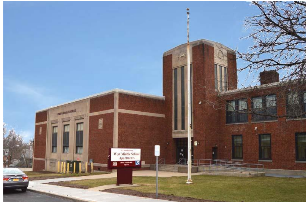
Auburn, New York