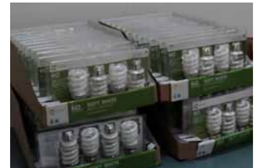
CFL Light Bulbs