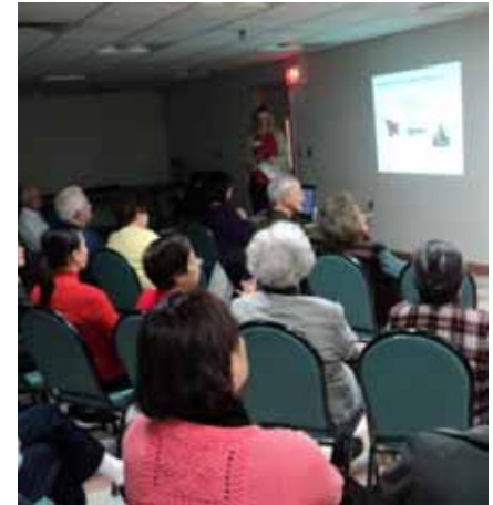
Energy Conservation Training