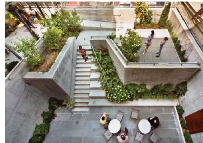
CAMBA Gardens CAMBA, Brooklyn Architect: Harden + Van Arnam Architects