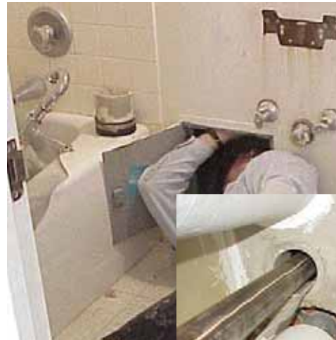
Other Openings Are Hidden