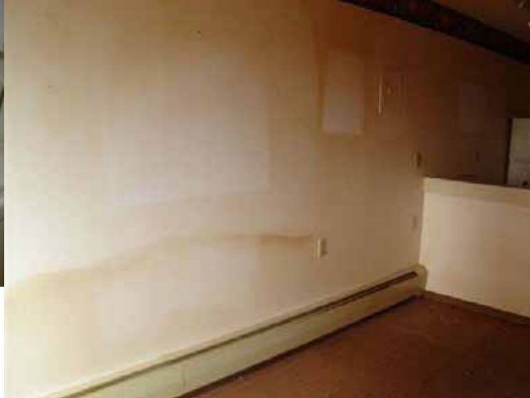
Residue on Walls