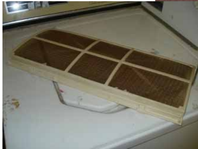
A/C Filter With Smoke Damage