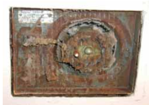
Corroded Bathroom Fan