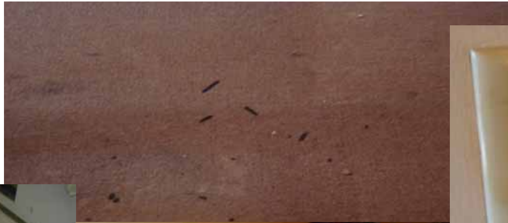
Cigarette Burns on Carpet