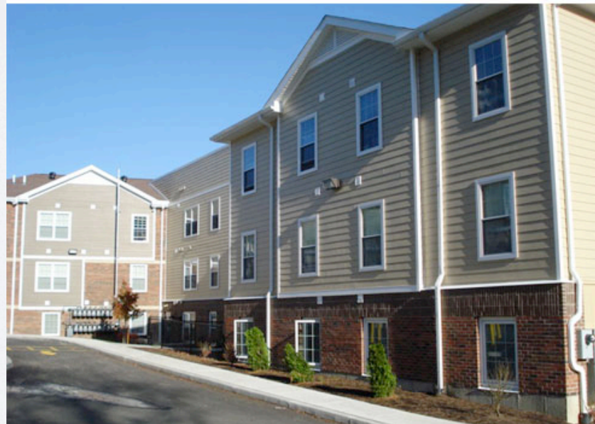
New Apple Yard Terrace Apartments: Jamestown