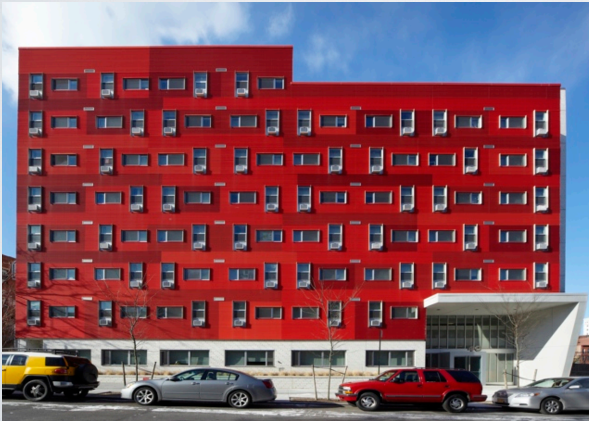
Navy Green: Brooklyn