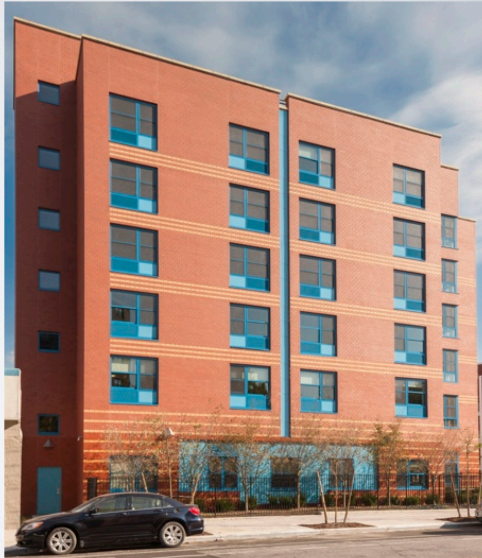
Halletts Cove House: Queens