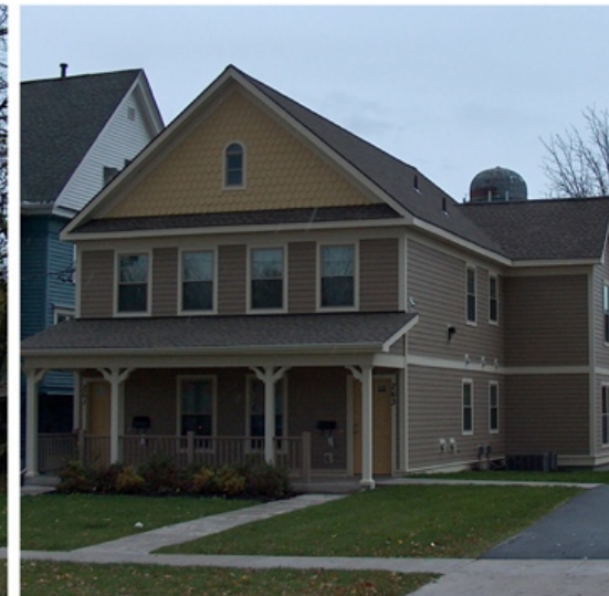
Lockport Canal Homes: Lockport