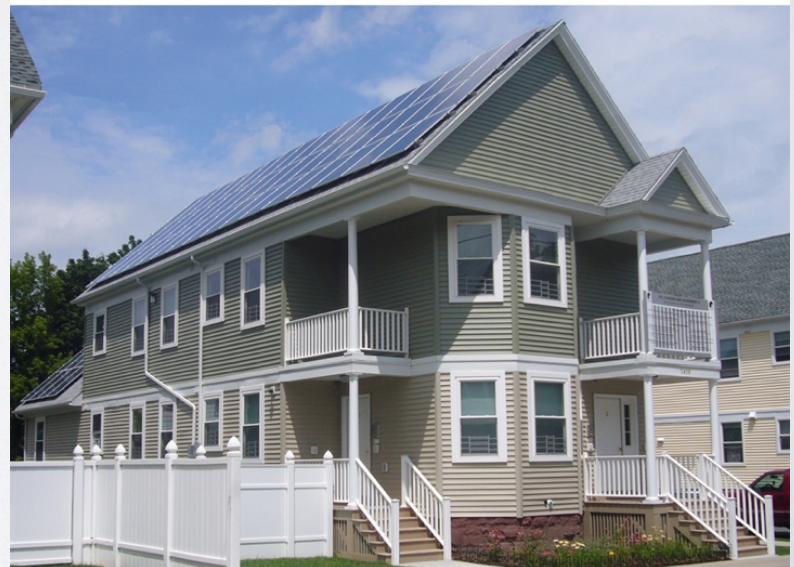
Johnson Park Apartments V: Utica