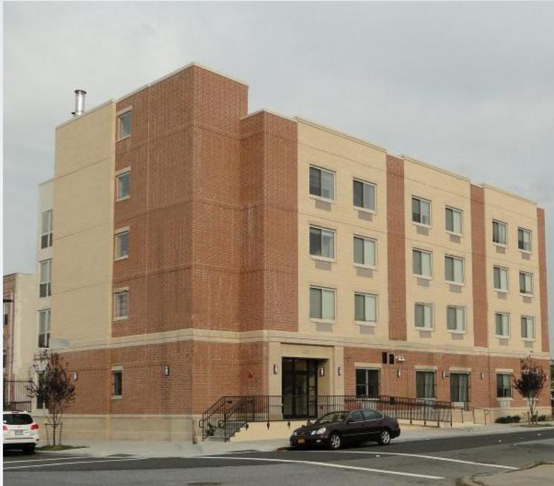
Dewitt Supportive Housing: Brooklyn