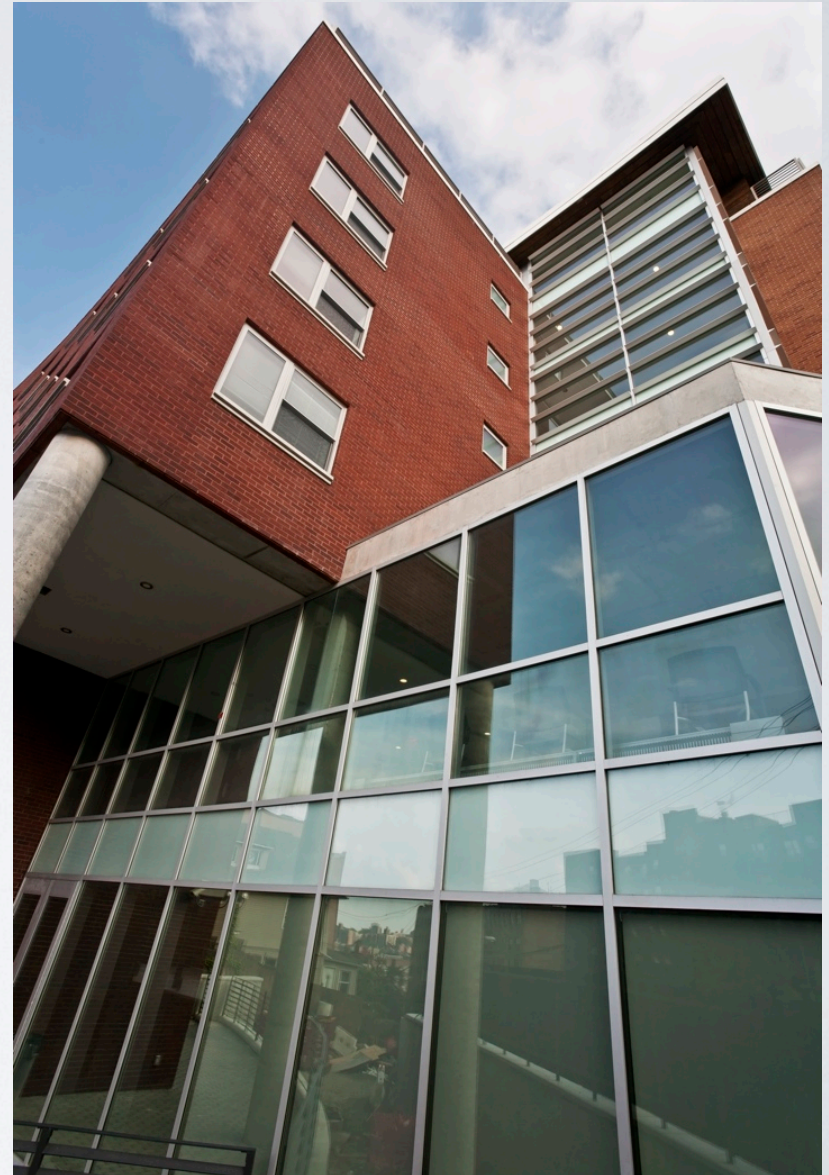
Kingsbridge Terrace: Bronx