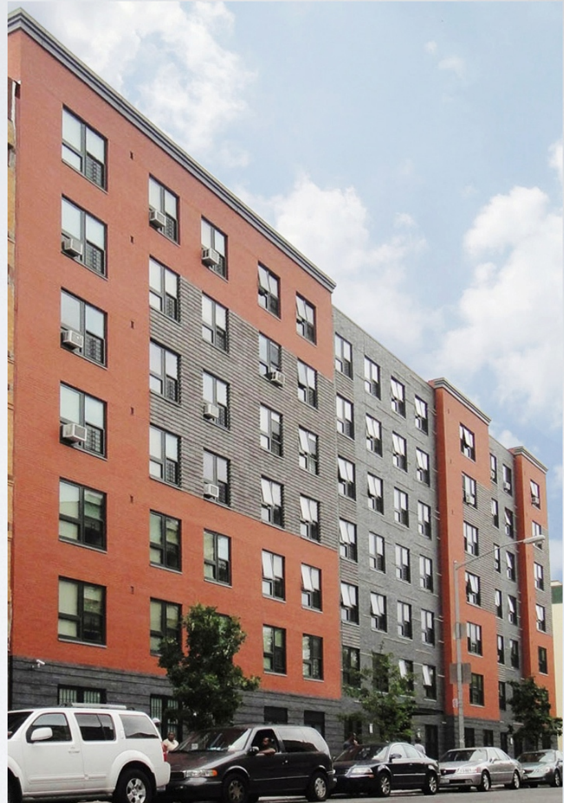
2081 Madison Ave: Manhattan