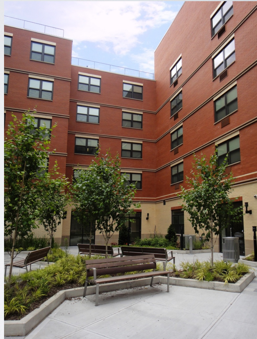
1710 Vyse Ave: Bronx