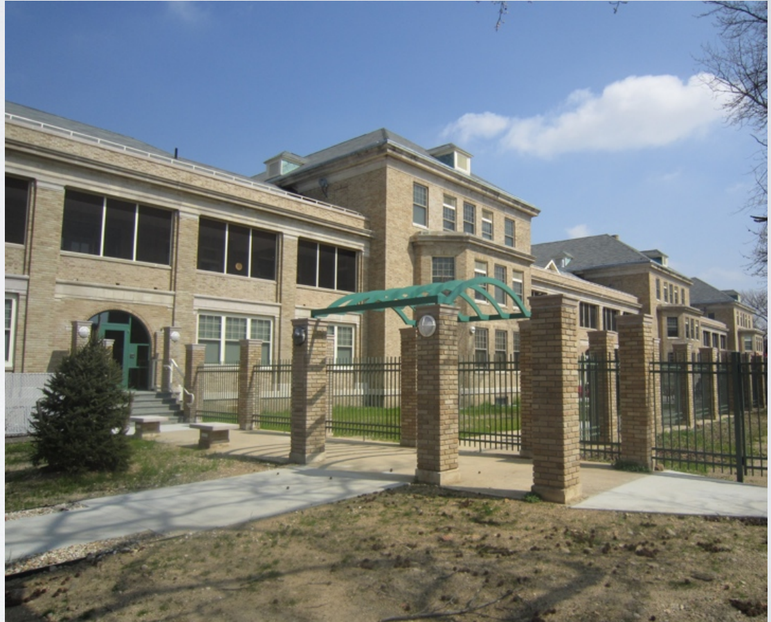
74 Avenue A: Queens