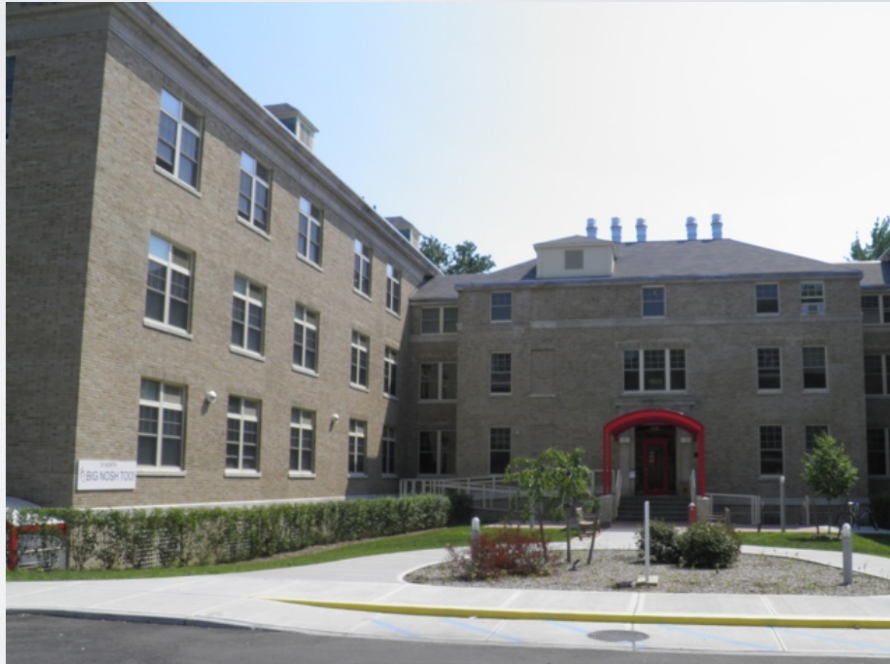
Hazel House: Queens