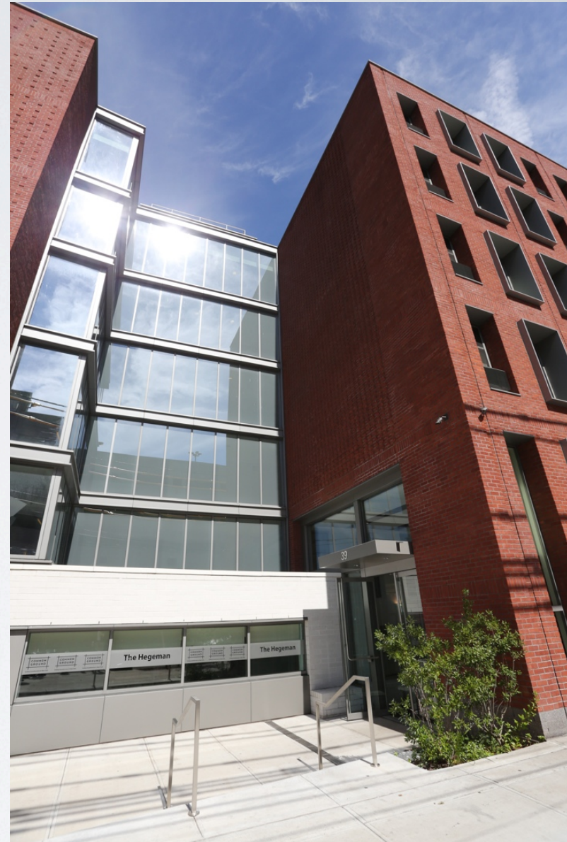
The Hegeman: Brooklyn