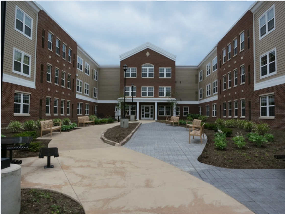
Eastman Commons: Rochester

80 units: 41 formerly homeless and 39 low-income individuals