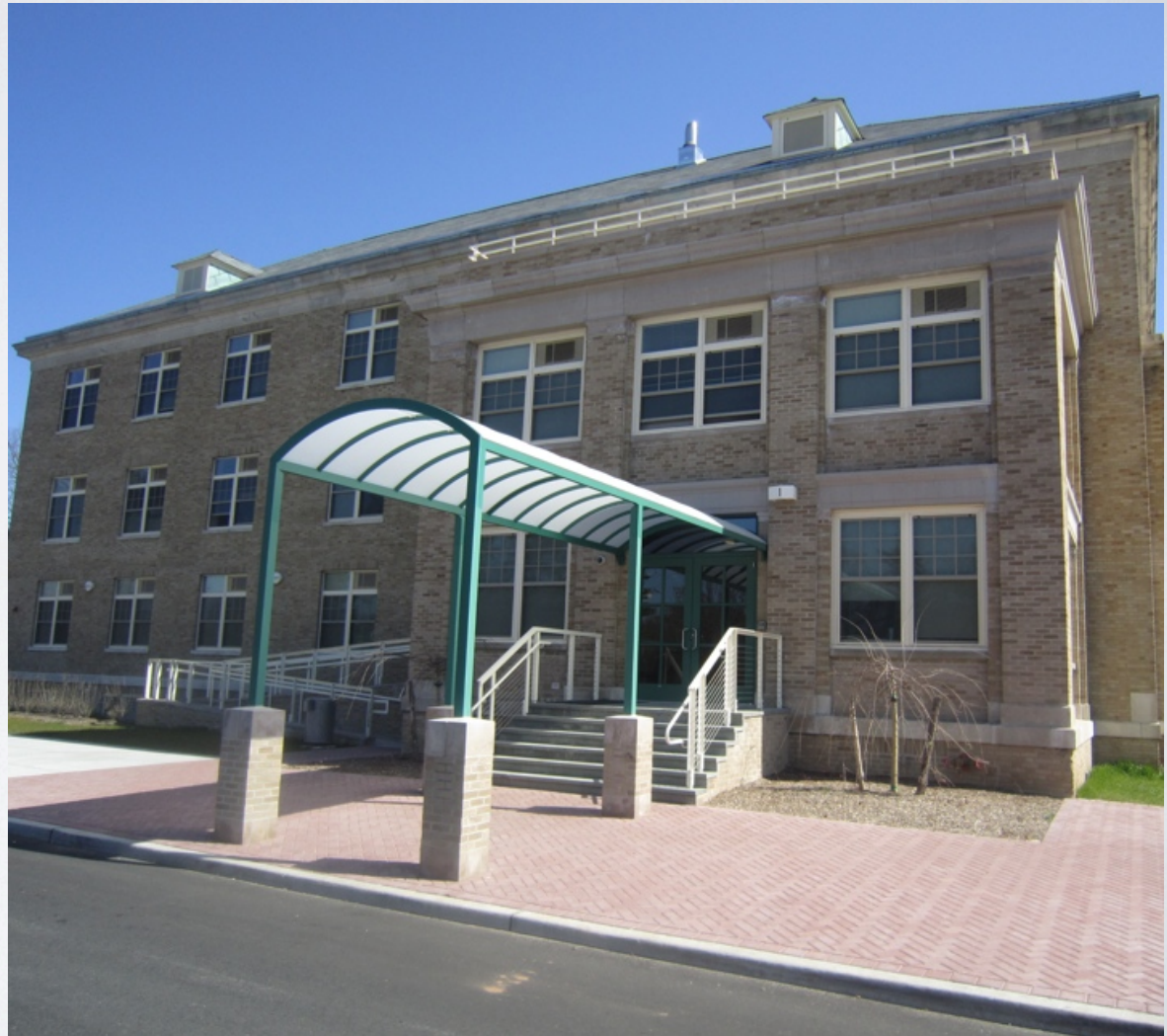
Frank Padavan 6th Street Residence: Queens