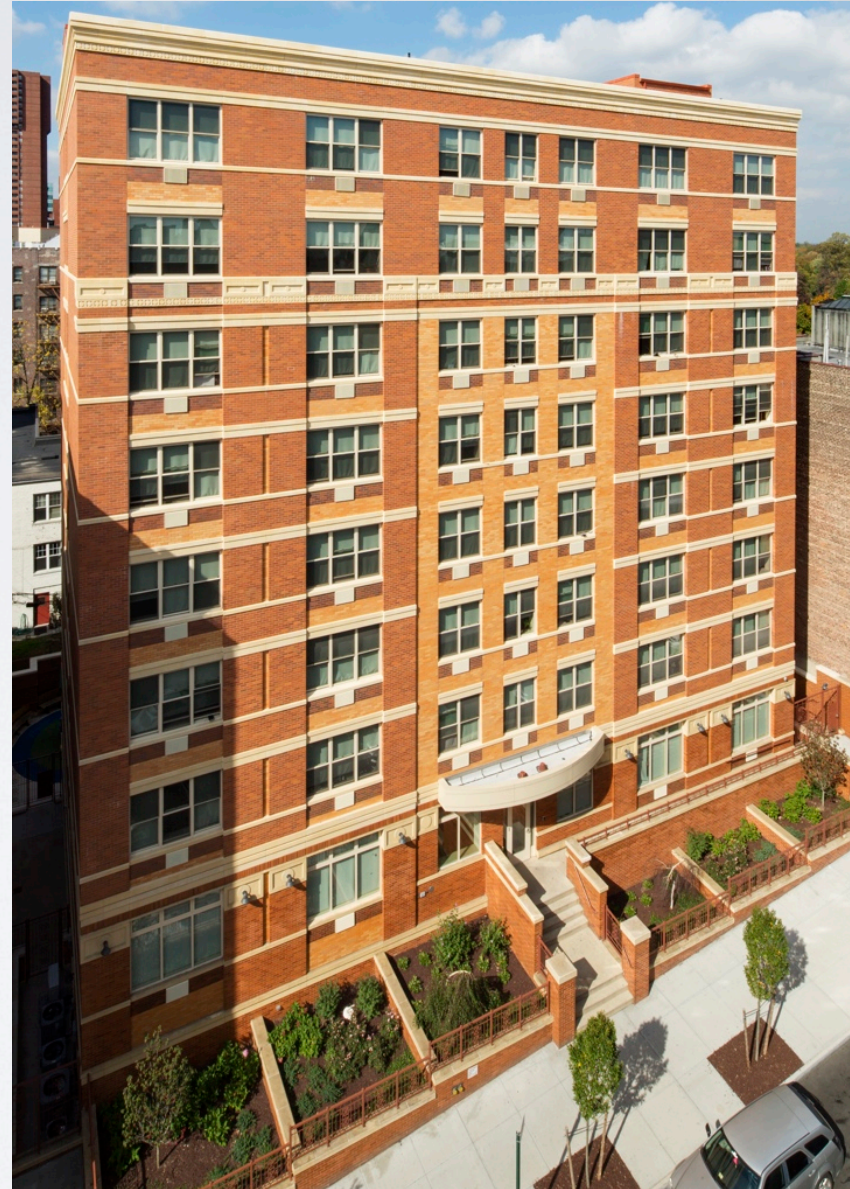
Hull Avenue Residence: Bronx