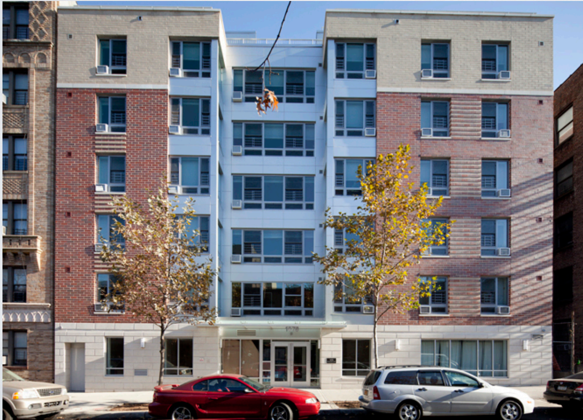
The Anderson: Bronx

40 units: 6 domestic violence surviving individuals, 14 domestic violence surviving families, 9 low-income individuals, 11 low-income families