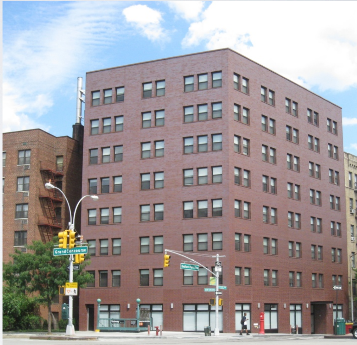
Grand Concourse Residence: Bronx