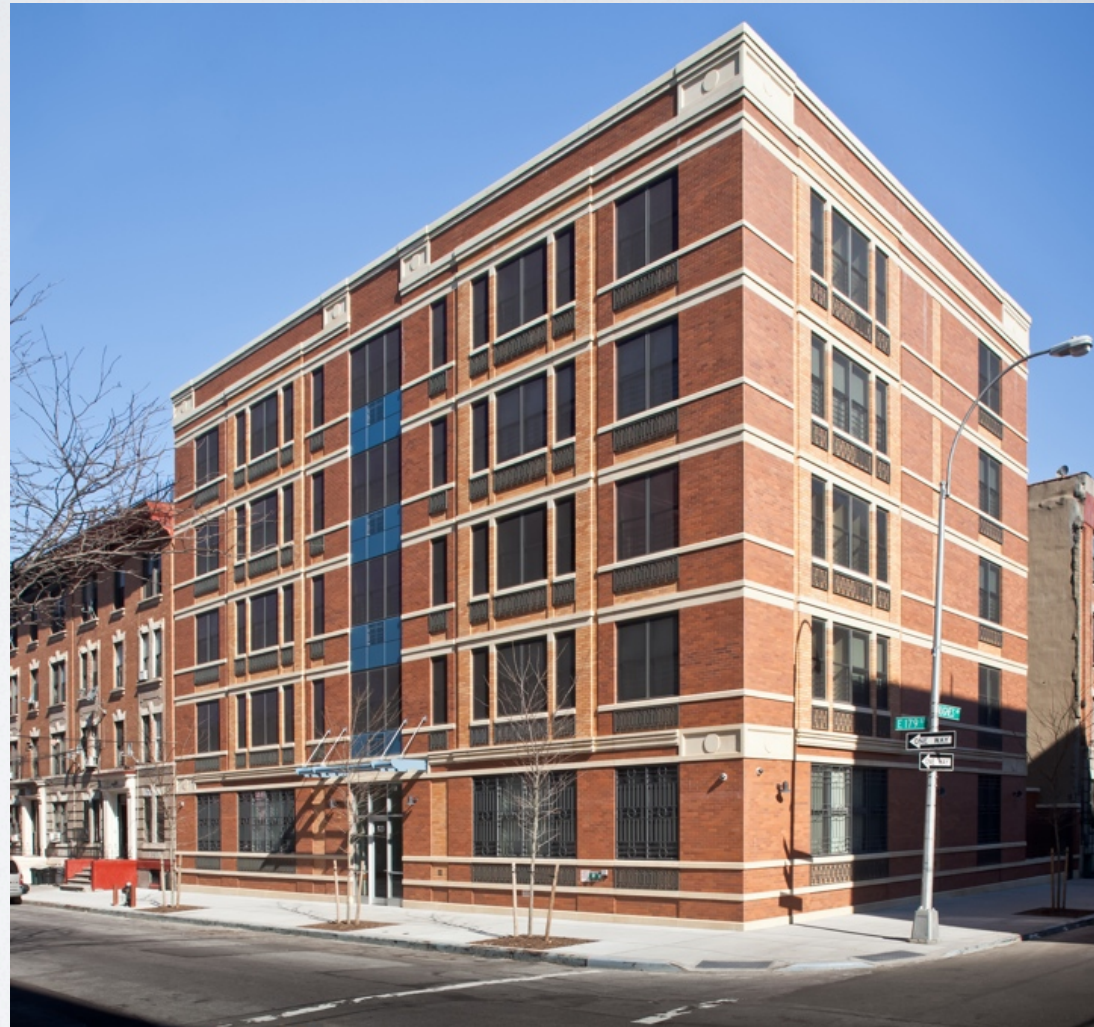
Lenniger Residences: Bronx