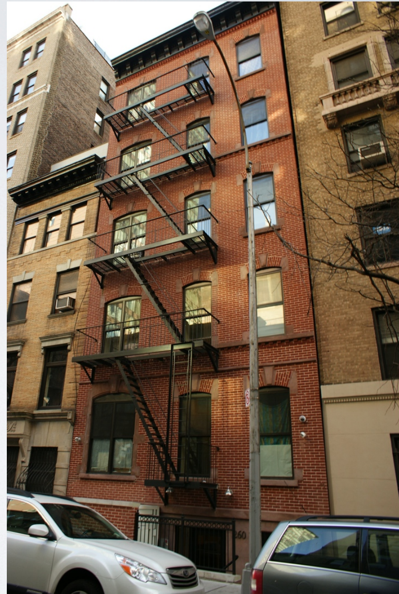
Bilander Hall: Manhattan