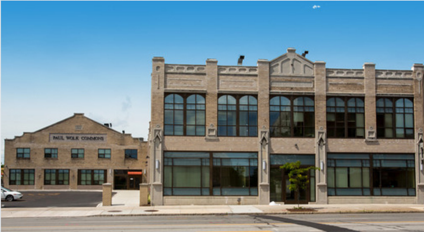
Paul Wolk Commons: Rochester